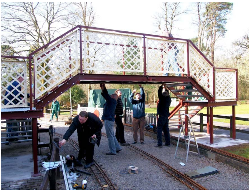
Members refitting the panels and adding the signalling furniture