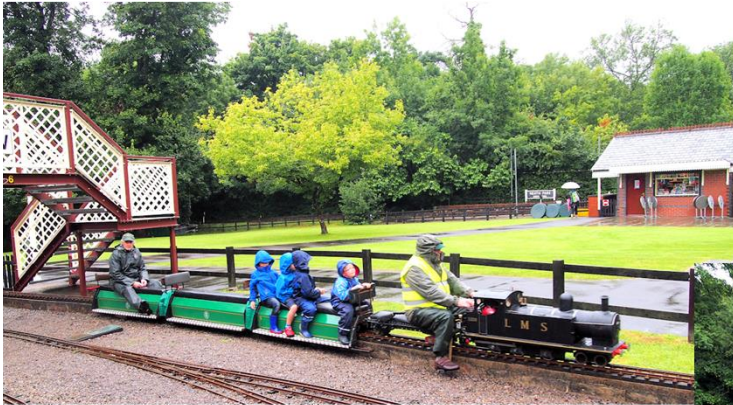
The Birthday Party crowd made the best of the weather at the July Open Day