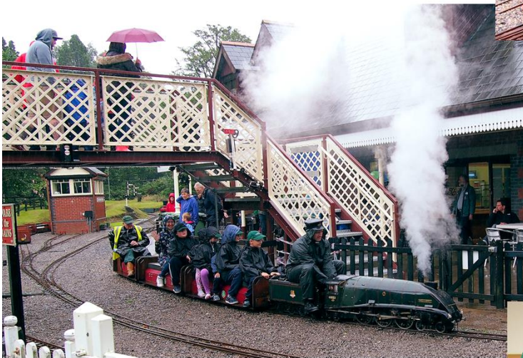
The Chernobyl children said goodbye after enjoying their rather wet visit!