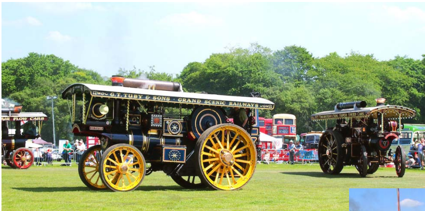
The Main Ring and time for sandwiches