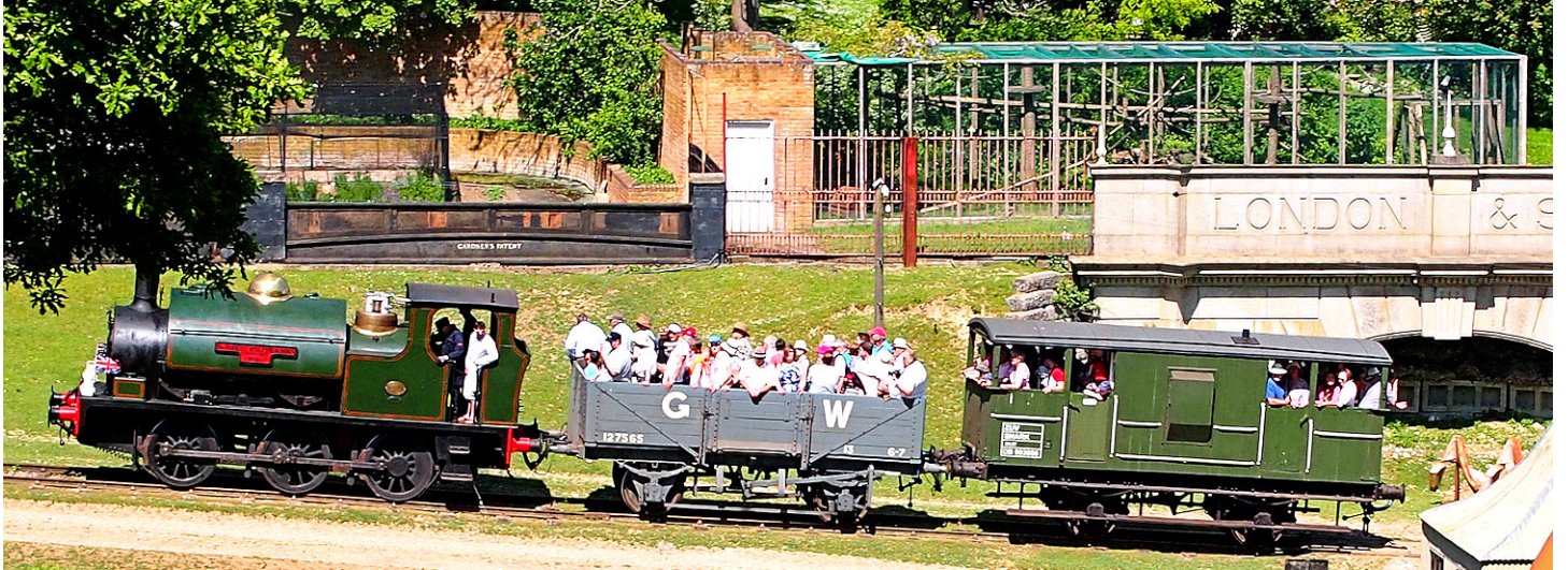
The steepest standard gauge track in Britain 1:13.6