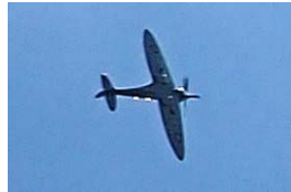
Both flying over the Ring