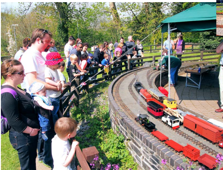
As always the Garden Railway attracted a big crowd especially younger children.