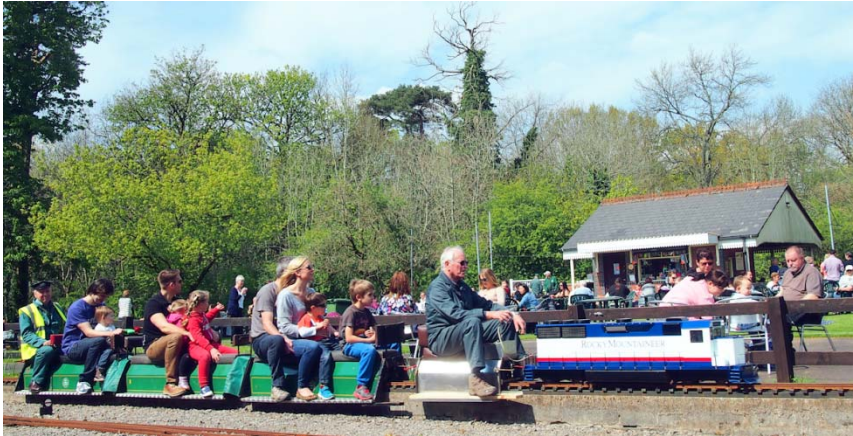
Society Locomotive 'ROCKY MOUNTANEER' takes a turn on the Raised Level track.