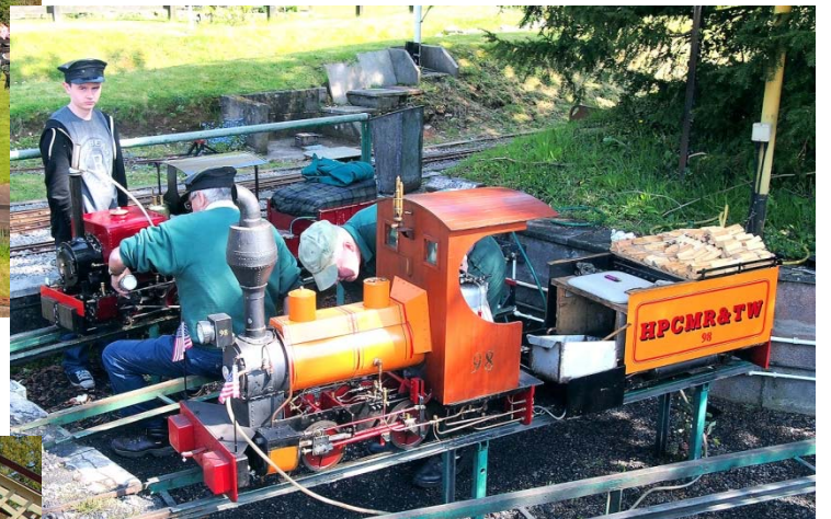
Steam Locomotive preparation